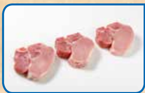
Porterhouse Pork Chop