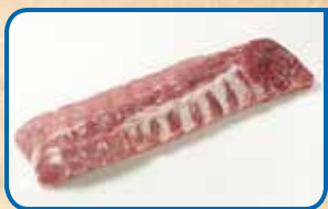
Loin Back Ribs