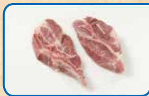
Shoulder Country-Style Ribs; bone-in