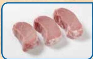
New York Pork Chop