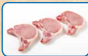
Ribeye Pork Chop