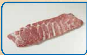
St. Louis-Style Ribs

For recipe ideas visit: PorkBeInspired.com