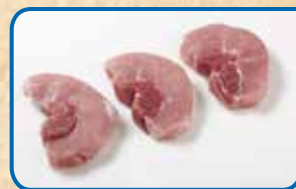
Sirloin Pork Chop; boneless