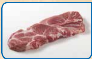
Shoulder Steak; bone-in