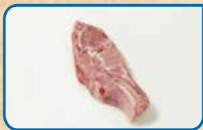
Loin Country-Style Ribs; bone-in