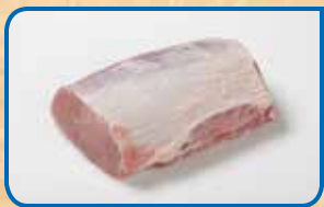
New York Roast