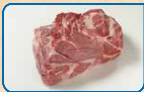
Shoulder Roast; bone-in