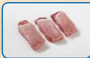
Loin Country Style Ribs; boneless